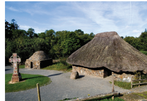
Irish National Heritage Park