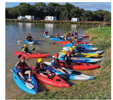
IOAC Outdoor Adventure Centre