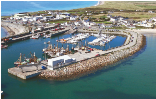
Kilmore Quay Fishing Village

Enjoy a Super Fun Day at Leisure Max Wexford