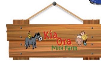
Kia Ora Fun Farm is in Gorey

Enjoy a Super Fun Day at Leisure Max Wexford