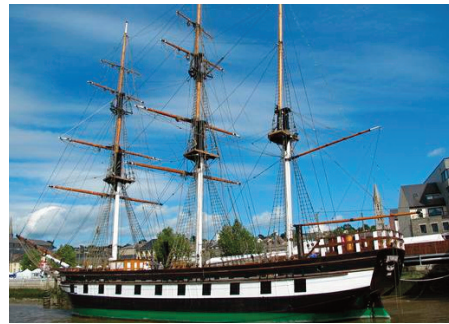
Dunbrody Famine Ship New Ross