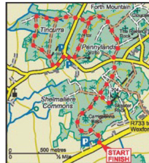
Forth Mountain Walking Trail