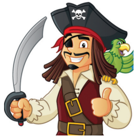
Pirate's Cove Countown

Google some of our historic landmarks and fun spots to make your stay in Wexford even more enjoyable